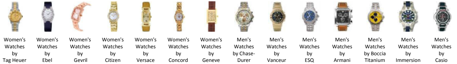
Women's Watches by Tag Heuer